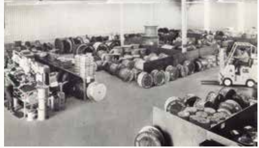
May 1973 - Industrial Electric purchases its first forklift - an Allis Chalmers.